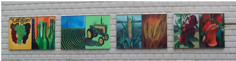
The Harvest Feast mural was painted by students & faculty from Andrews University.