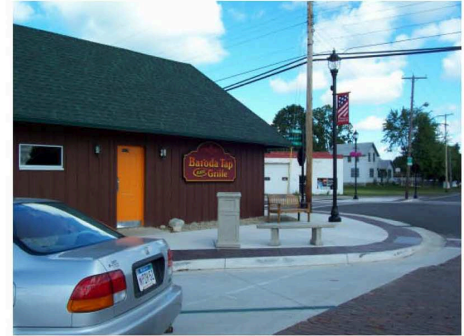
The Revolving Loan Fund and Commercial Tax Abatements helped to make the Baroda Tap & Grille, Founders Wine Cellar and Tabula Rasa Gallery a reality in Baroda.